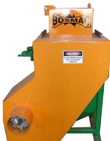
Stand + Hopper + Drive