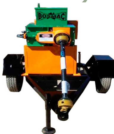
Trailer not suitable for use on public roads.

PTO-powered roller mills are supplied with PTO drive pack (step-up pulleys and counter shaft for 540) and come with PTO shaft and slip clutch.